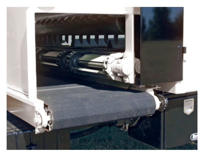
Side Discharge - available with belt, chain & slat, or auger option.