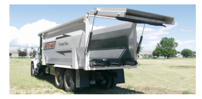
Rear Discharge - tailgate opens with two hydraulic cylinders to near 90 degrees.