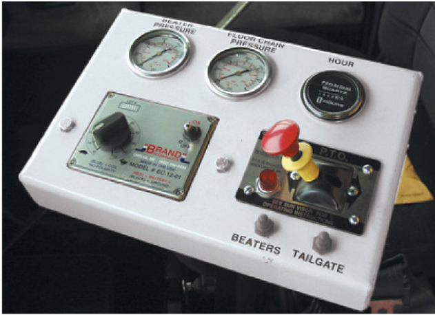
Ease of use cab control panel.